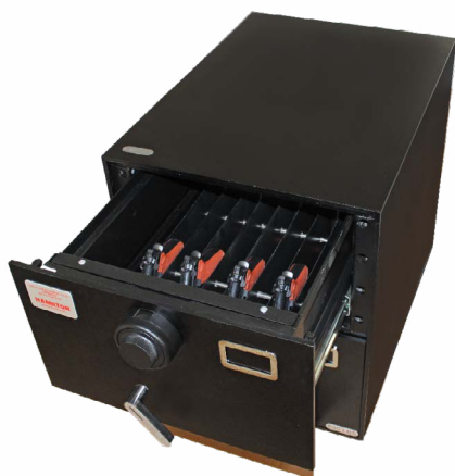
Class 5, legal size, single lock in black shown above