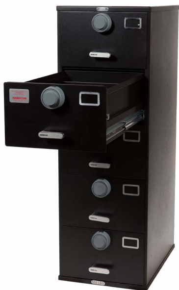
Class 6, 4 drawer, legal size, multi-lock in black shown to left

The Class 5 cabinets are approved for the storage of secret, top secret, and confidential, as well as Class 1 & 2 controlled substances, monetary funds, and precious metals. While the Class 6 cabinets are approved for the storage of secret, top secret, and confidential.