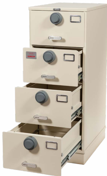
Class 6, 4 drawer, legal size, multi- lock in parchment shown below